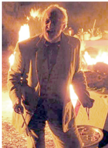
Robert Englund in Velvet Steamroller's "2001 Maniacs"

The company's first feature is "2001 Maniacs," Tim Sullivan's remake of Herschell Gordon Lewis' cult classic "Two Thousand Maniacs." Robert Englund ("A Nightmare on Elm Street") stars in this story of young Yankees under assault by the undead denizens of a Georgia town that were massacred in the Civil War. It's being sold under the tagline "The South Will Rise Again."